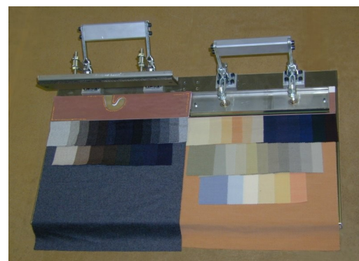
Model PD 2700